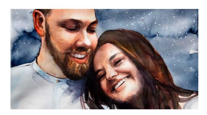
Let me not to the marriage of true minds Admit impediments. Love isn't love Which alters when it alteration finds. Shakespeare Sonnet 116.