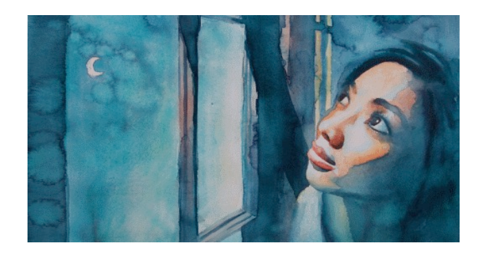
Perverse and foolish oft I strayed, But yet in love he sought me, And on his shoulder gently laid, And home, rejoicing, brought me. Hymn, The King of love my Shepherd is 1868.