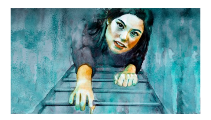
The spirit of self-help is the root of all genuine growth in the individual. Samuel Smiles, Self-Help 1859.